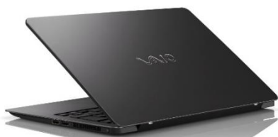
VAIO Z clamshell model